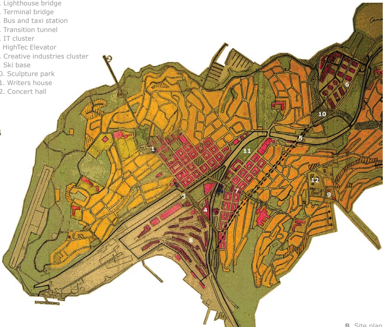
B. Site plan