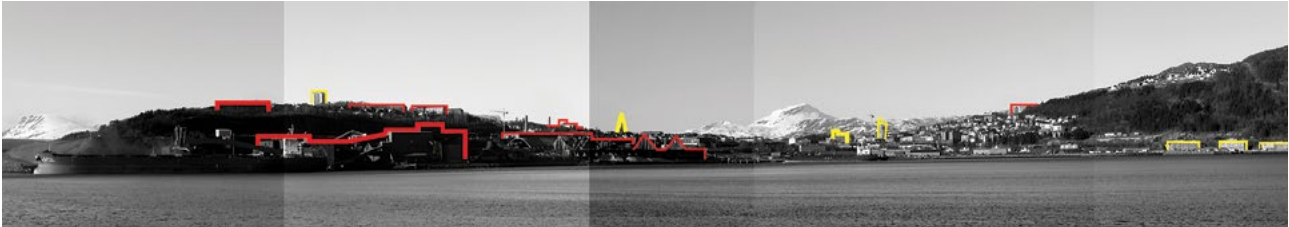
A. Diagram for High-rise building development